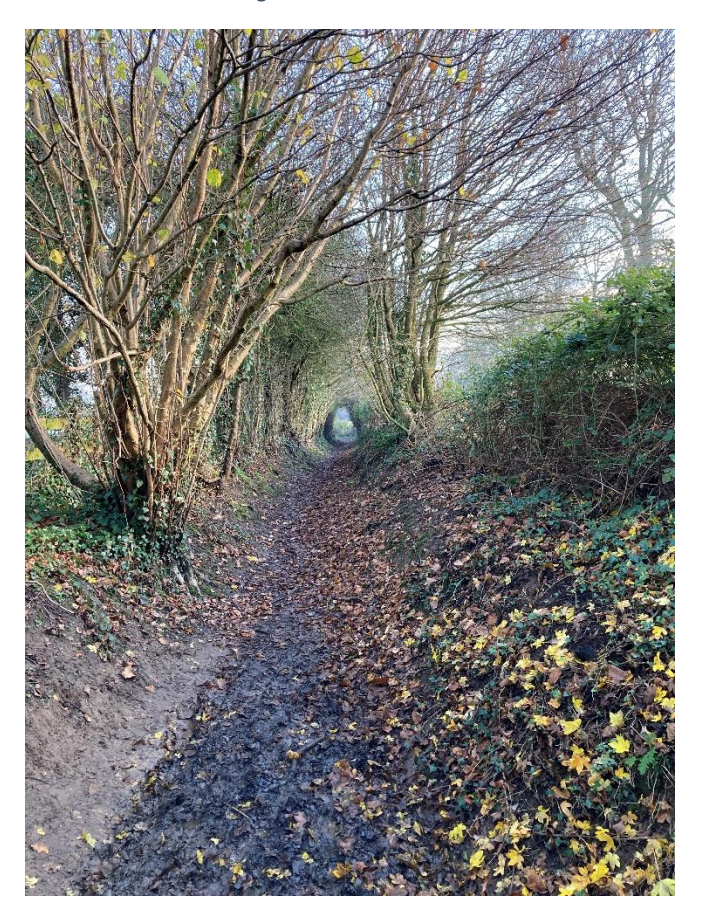
6. Point B looking east