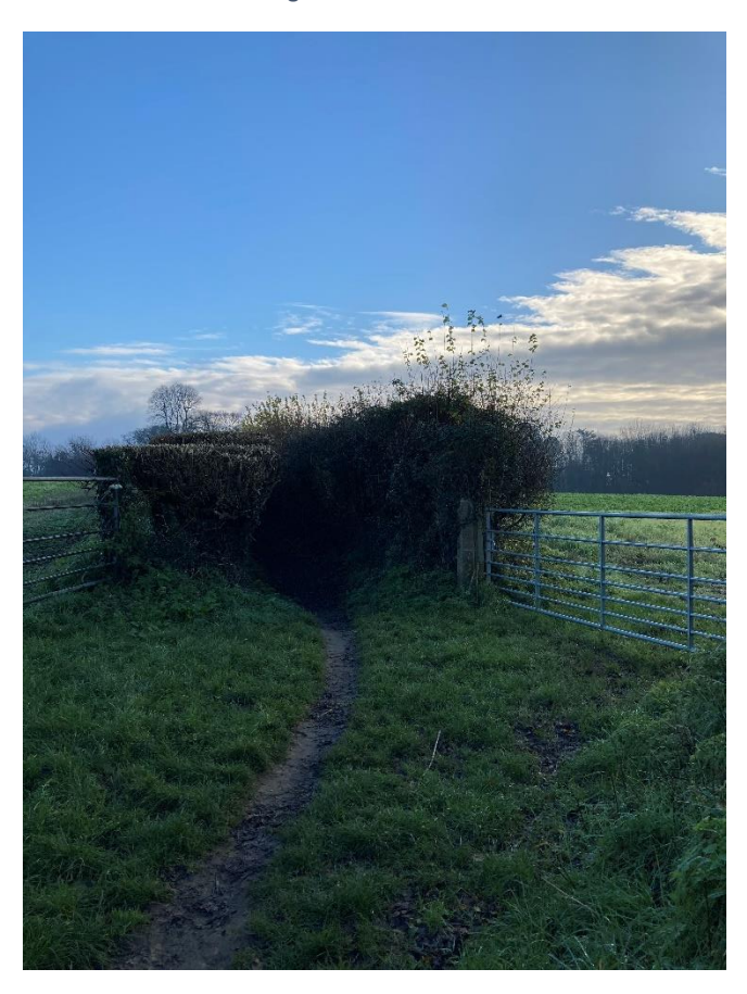
4. Point A1 looking east