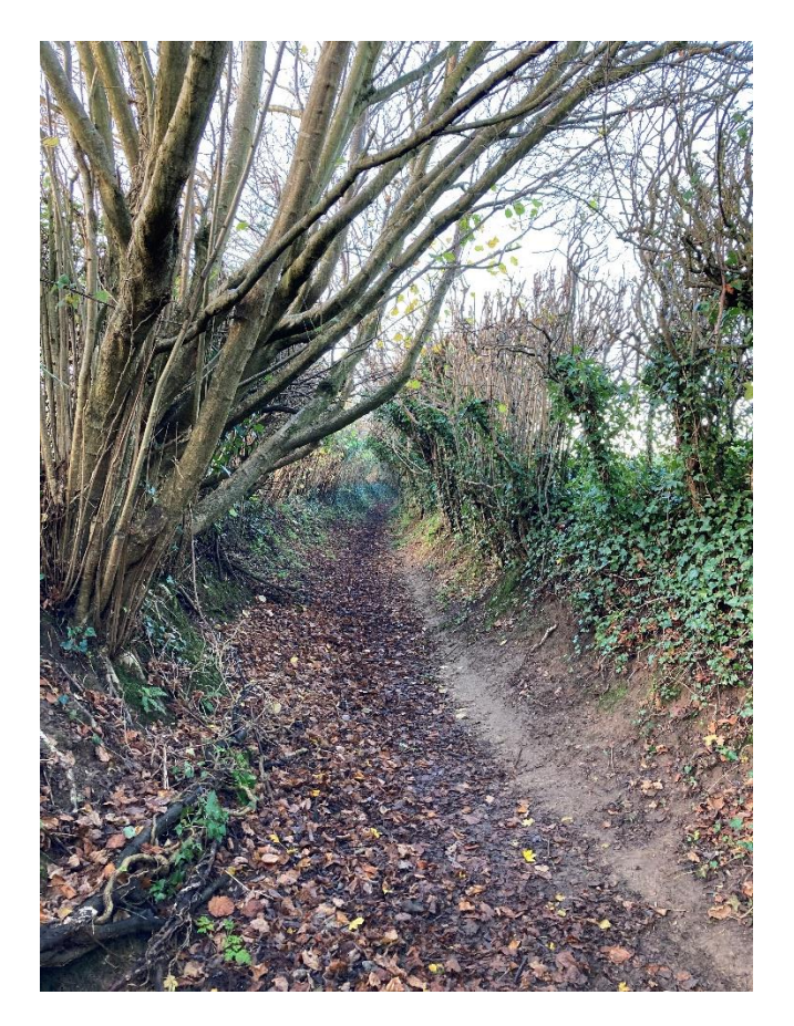
5. Point B looking west