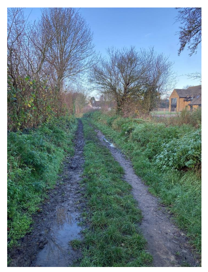
2. East of Point A looking east