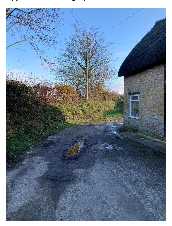
1. Point A looking east