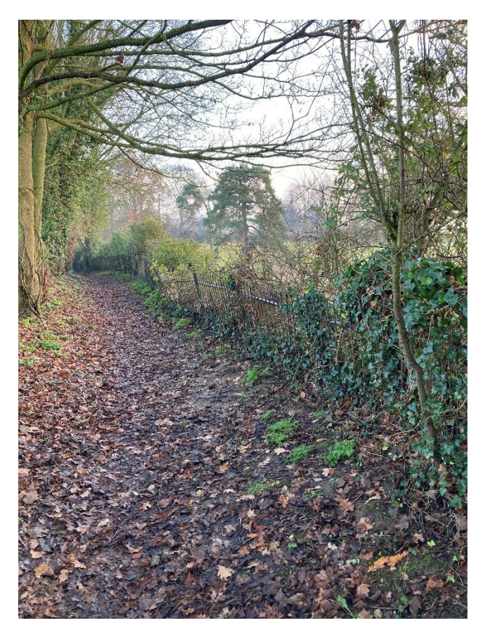
7. Between points B and C looking east