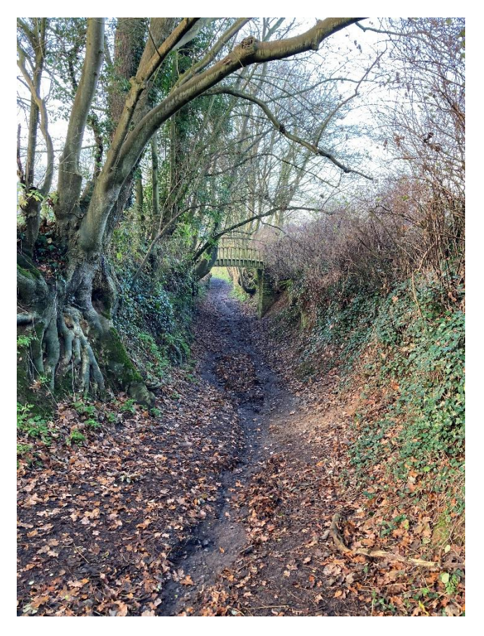
9. Point D looking west