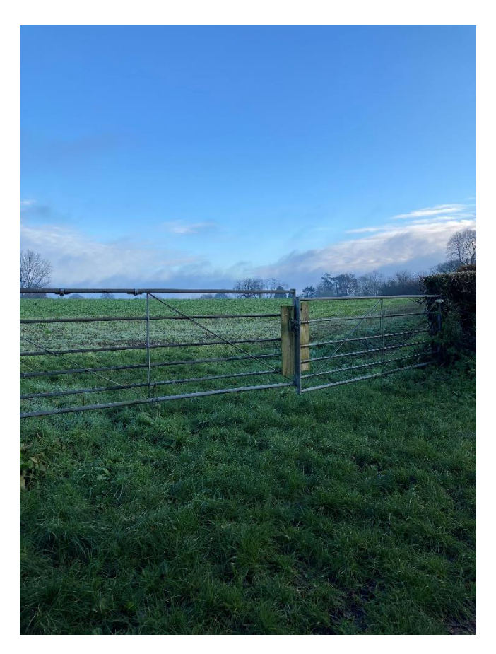
3. Point A1 looking north